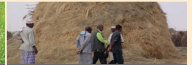
Harvested pasture stored in open