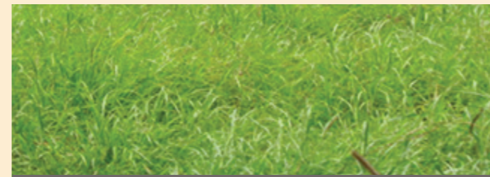
Pasture in field

Towards this endeavor, IGAD member states have a number of initiatives meant to increase pasture and fodder crop production and quality but since the efforts are not coordinated and with limited magnitude, we are unable to address the feed crisis. IGAD/ ICPALD in collaboration with partners compiled and documented good practices that will enhance fodder and range and seed production & marketing; established regional fodder-rangeland platform to exchange lessons and successful feed interventions and organized fodder promotion workshop for the private sector to inform on the available interventions that will help improve investment on feed and seed production. The purpose of this policy brief is to summarize and share key limitations and proposed recommendations to policy makers and stakeholders to promote further debate and enable concrete actions for enhanced feed security in the region.