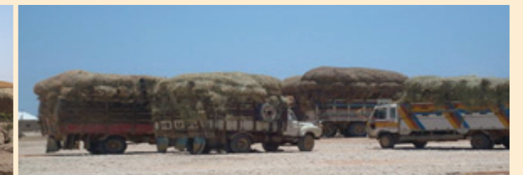
Fodder displayed for sale on market