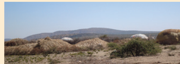
Crop residues conserved in the open