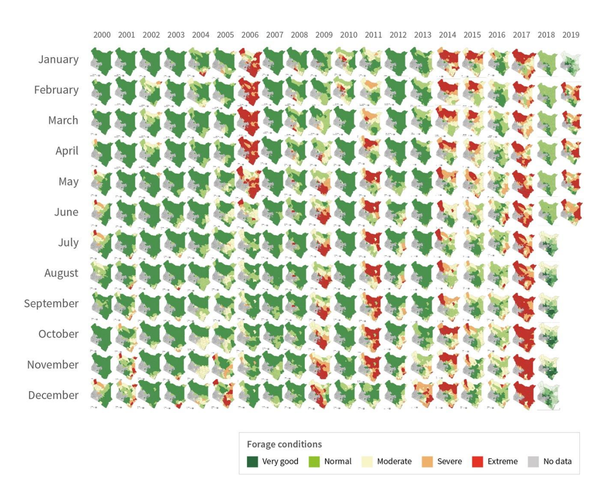
Figure 1. Predictive Livestock Early Warning System (PLEWS) Trends analysis (2000–2019)