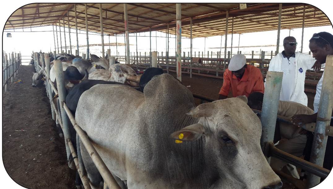
Figure 8: Ear Tagging at Quarantine