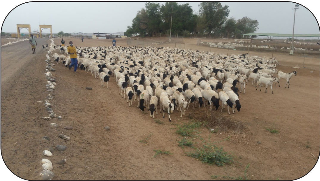
Figure 2: Marshalling Animals from Pre-quarantine at Djibouti International Quarantine