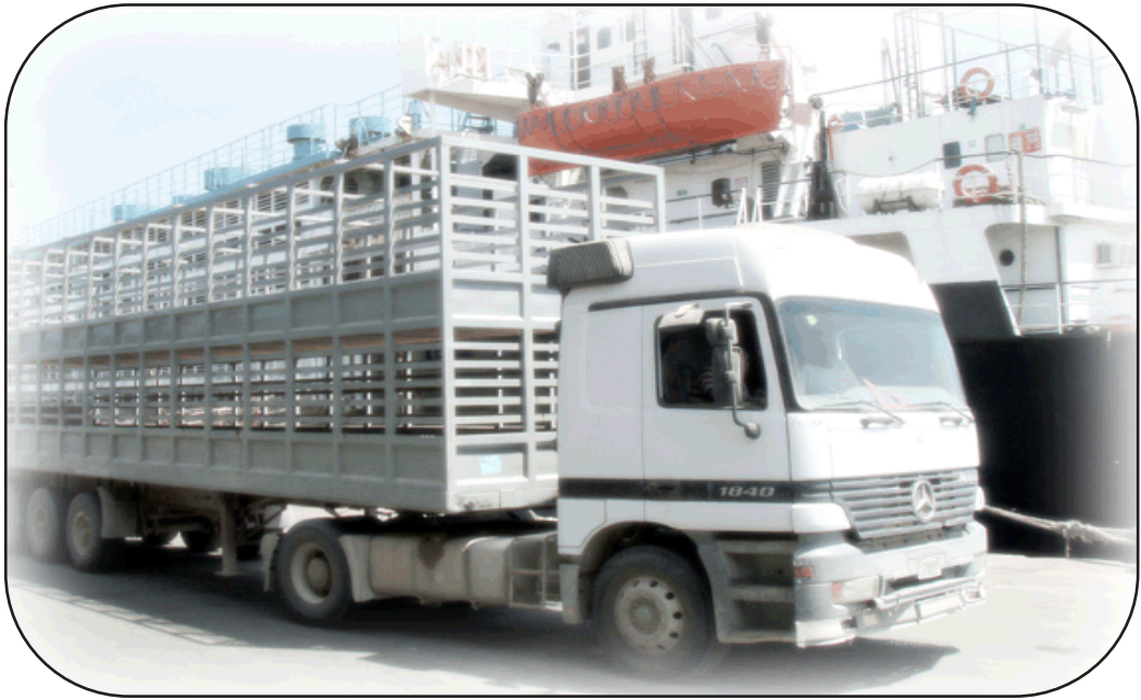
Figure 10: Sheep and Goat Transportation Truck at Post Quarantine