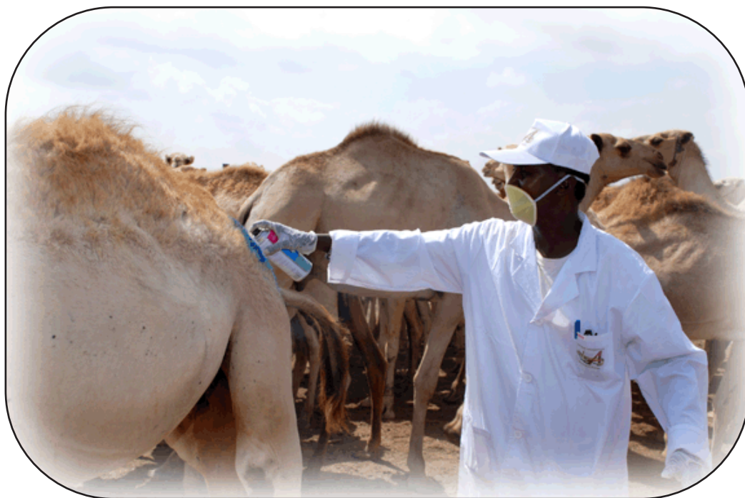
Figure 3: First Veterinary Inspection in Pre-quarantine