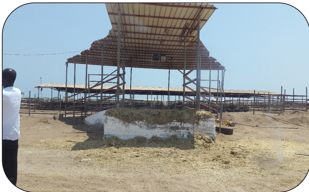
Figure 7: Loading Ramp with Shade for Large Animals Quarantine