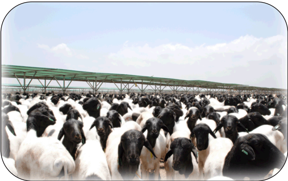
Figure 4: Sheep Ready for Export at Quarantine