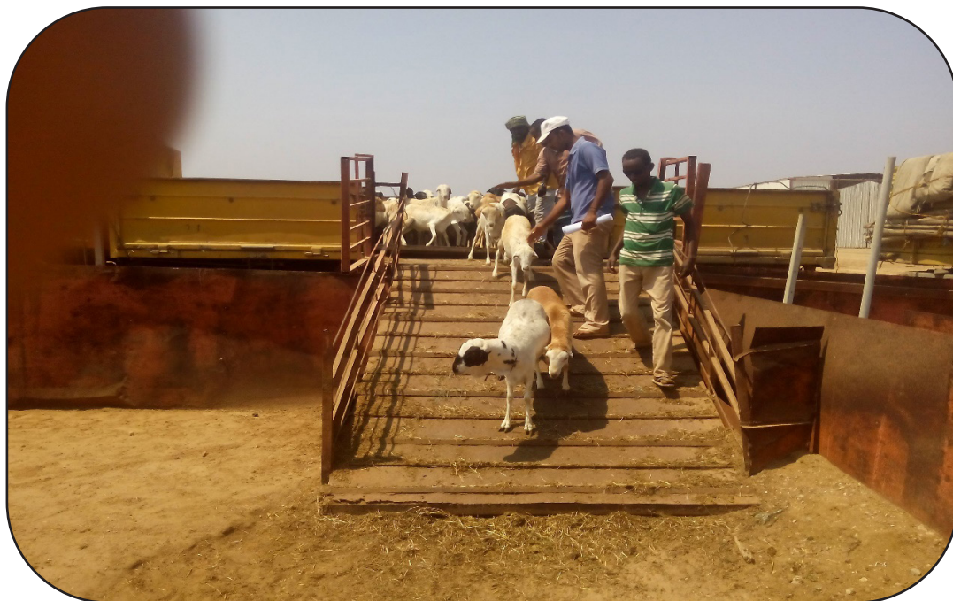
Figure 12: Offloading at the Port