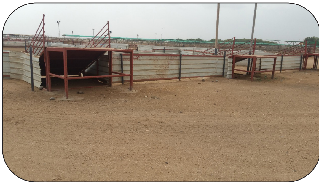
Figure 5: Loading and Offloading Ramps for Sheep and Goats