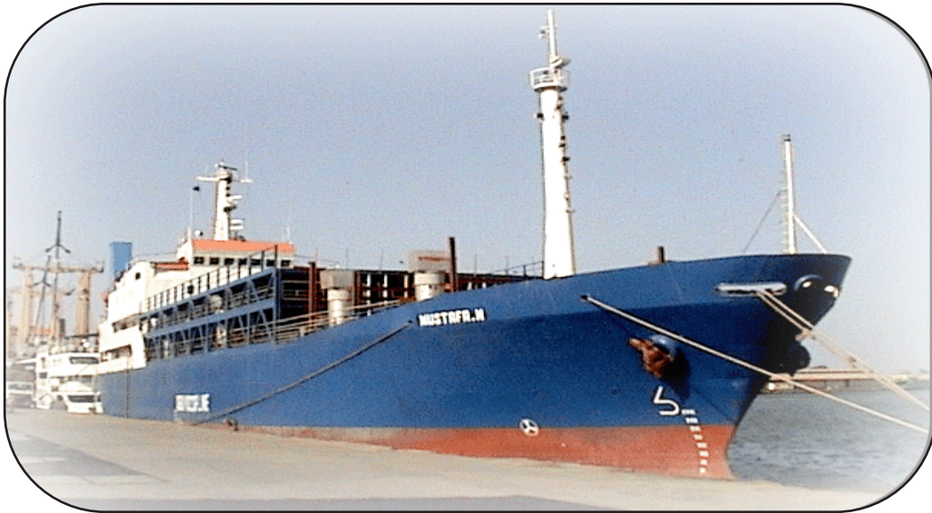
Figure 11: Vessel for Loading Animals