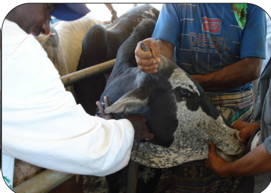
Figure 6: Blood Sample Collection at Quarantine