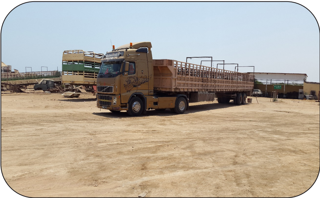
Figure 9: Transportation Truck to the Port from Quarantine

*By signing this form, I take responsibility of consignment